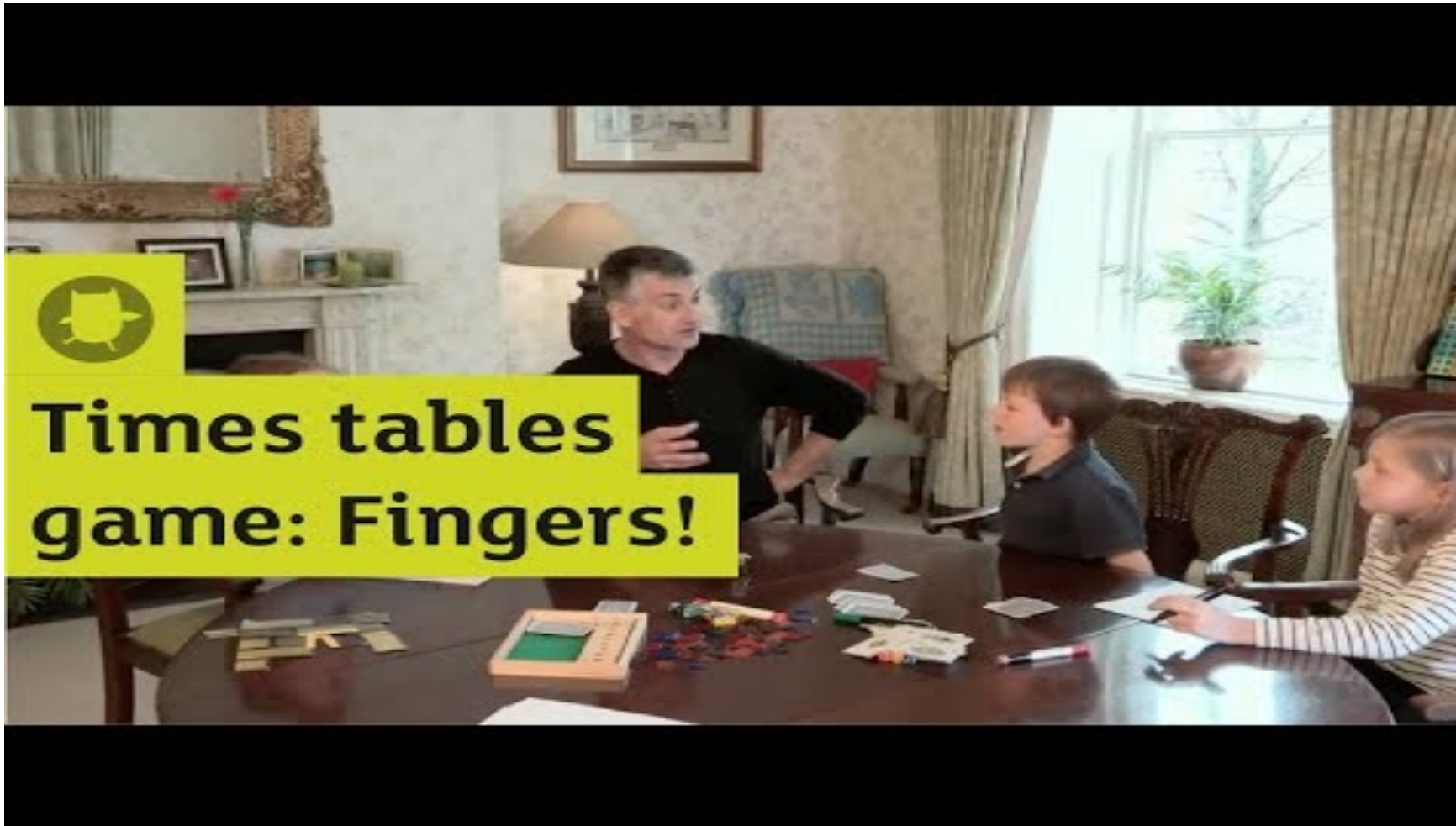
Multiplication Tables Check (MTC)

https://www.youtube.com/watch?v=FfGhH3TSoZI